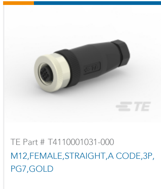
TE Part # T4110001031-000 M12, FEMALE, STRAIGHT, A CODE, 3P, PG7, GOLD