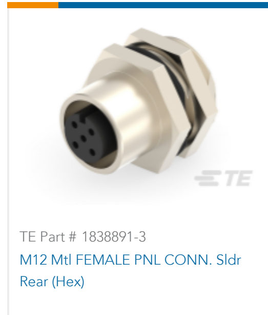
TE Part # 1838891-3 M12 MtI FEMALE PNL CONN. Sldr Rear (Hex)